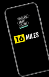
SCREEN SHOT OF YOUR MILEAGE

To enter, post your three pics on Instagram and tag @jtrunforall with the hashtag #YDFBingo .