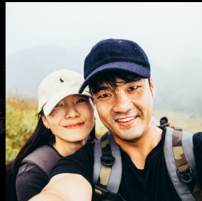
TAKE A SELFIE