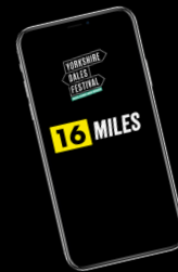
SCREEN SHOT OF YOUR MILEAGE

To enter, post your three pics on Instagram and tag @jtrunforall with the hashtag #YDFBingo .