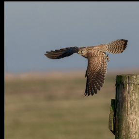
BIRD OF PREY