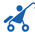
Baby Buggies Prams / Children's Seats'