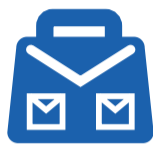
Small Bags / Backpacks (No bigger than an A4 piece of paper)