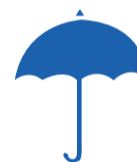
Umbrellas (except small fold up umbrellas)